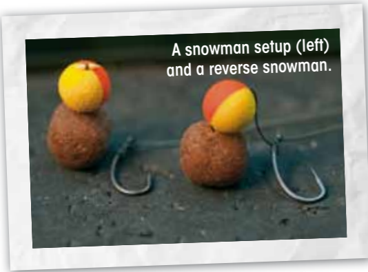
Putting the theory into practice has already paid off.